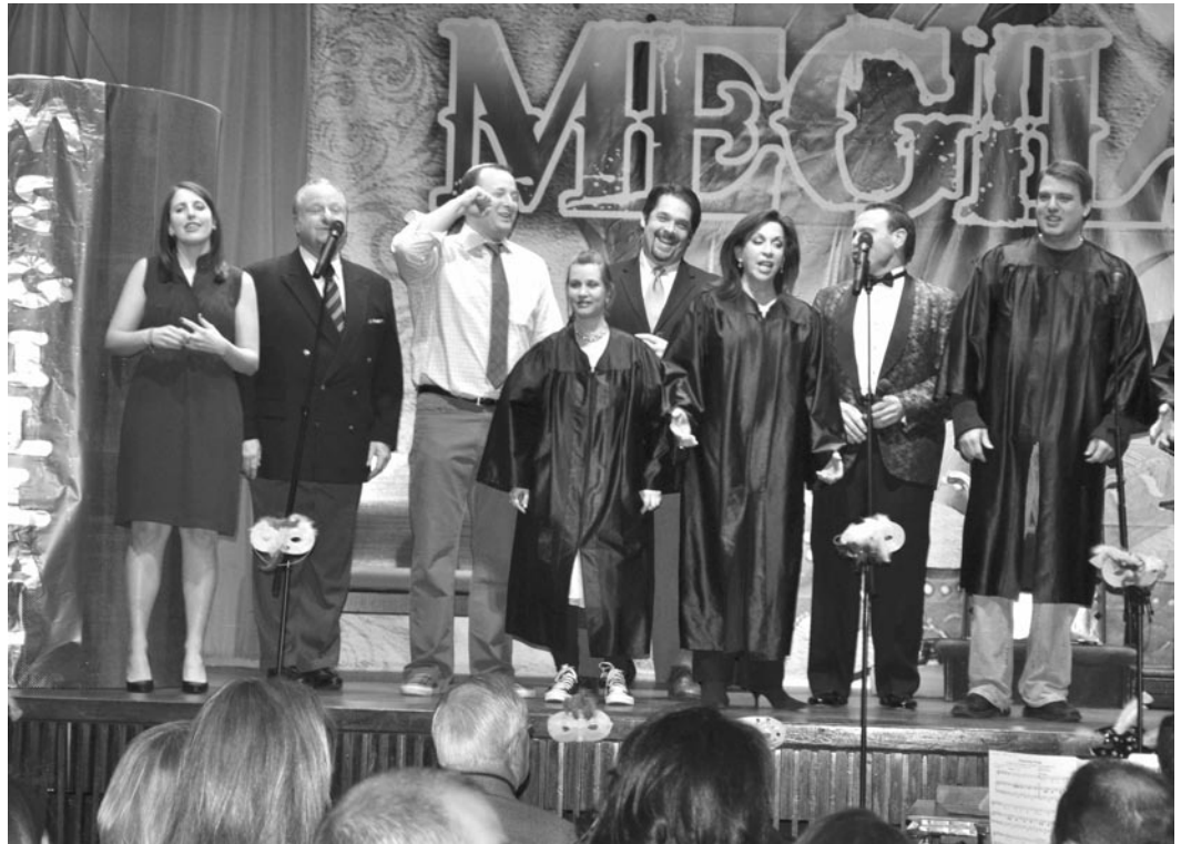
The Purim Players