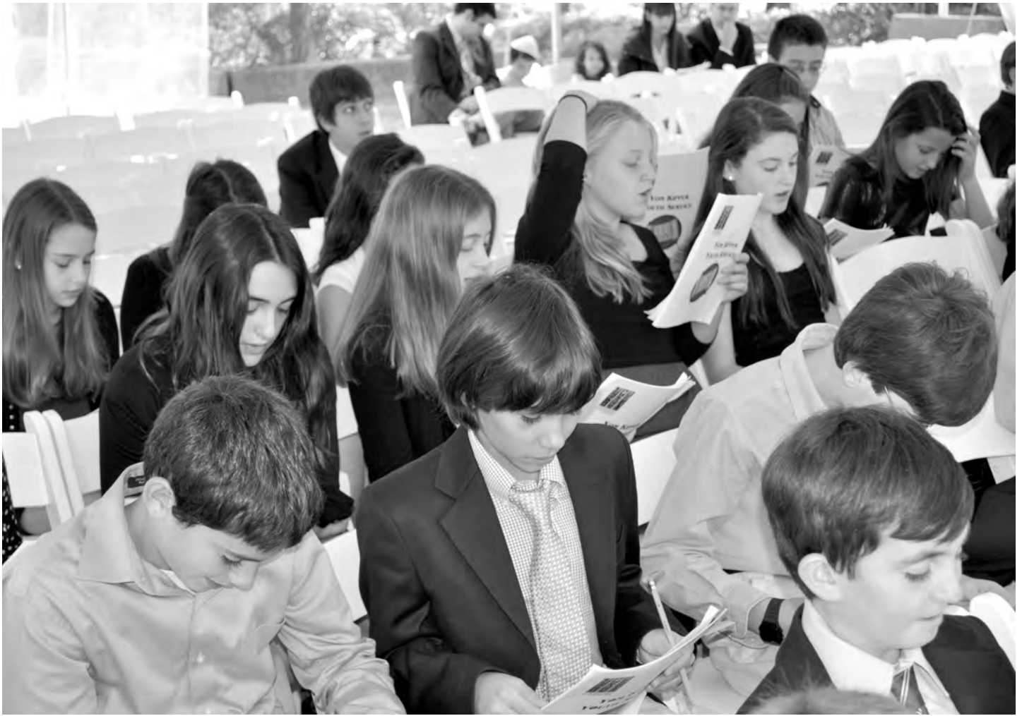
Yom Kippur Youth Service