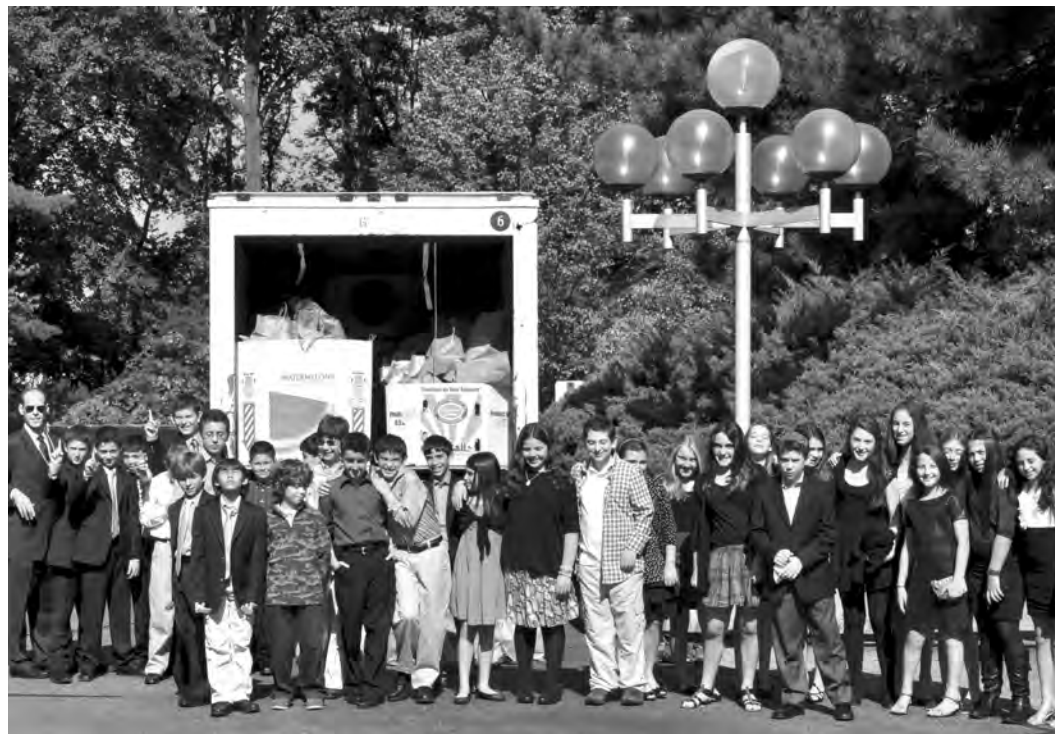
High Holy Day Food Collection

After our 5:30 pm service we'll gather for a festive Shabbat Dinner with music and Israeli Dancing. It's a fun, child-friendly evening. Members new to TBJ since last year will receive a personal invitation to attend. Join with them to make a great evening even better! Reservations forms will be found on line at www.tbj.org . Contact the Membership Committee at membership@tbj.org .