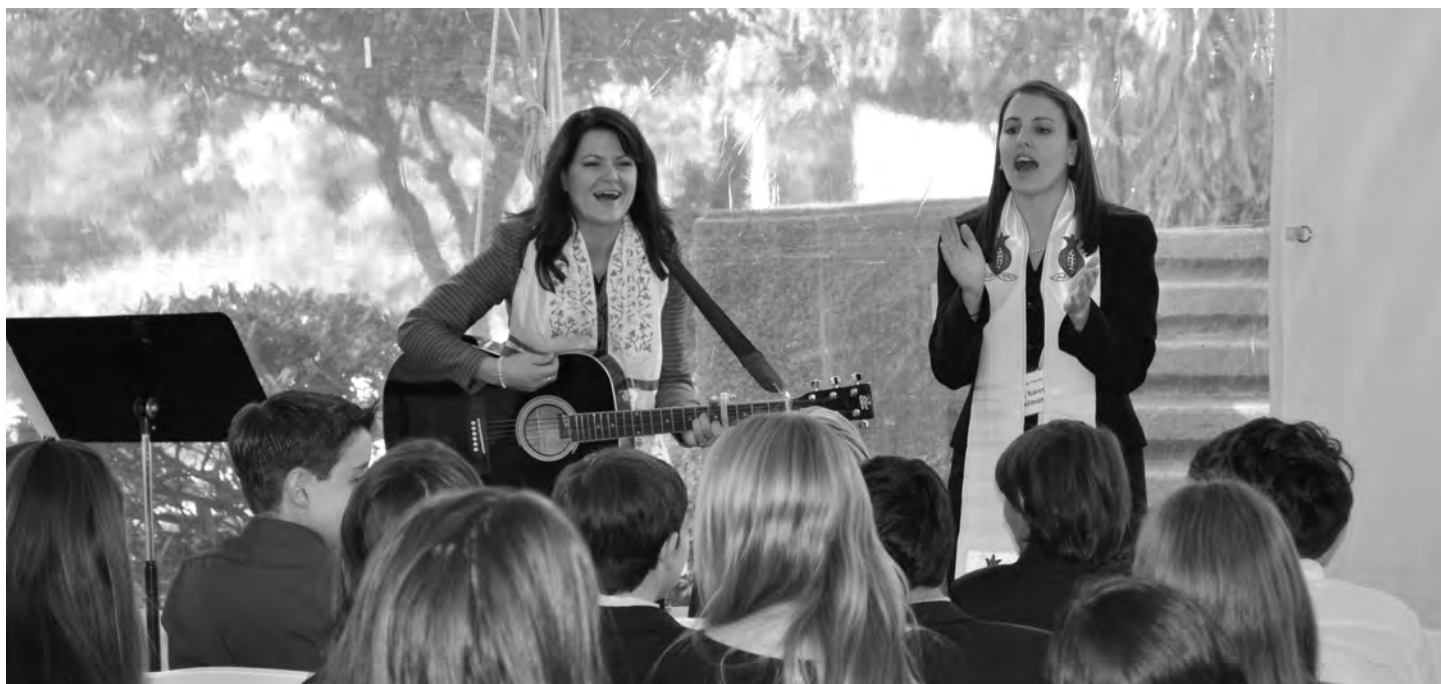
Yom Kippur Youth Service