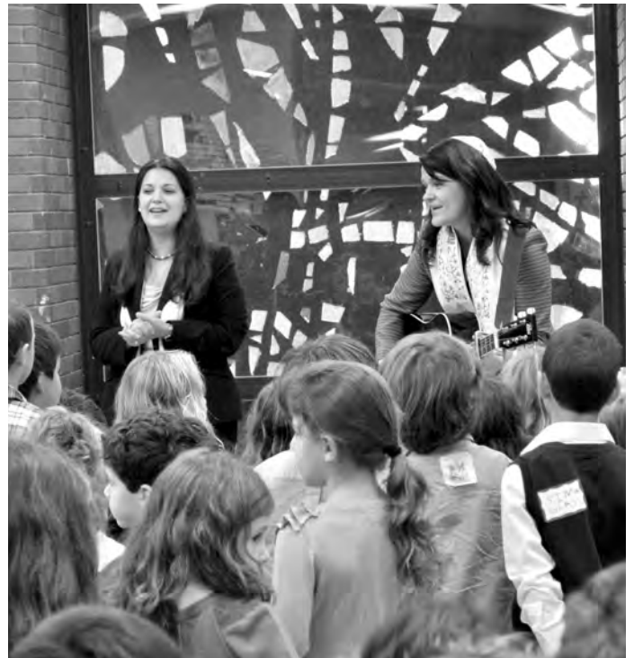
Yom Kippur Religious School Service